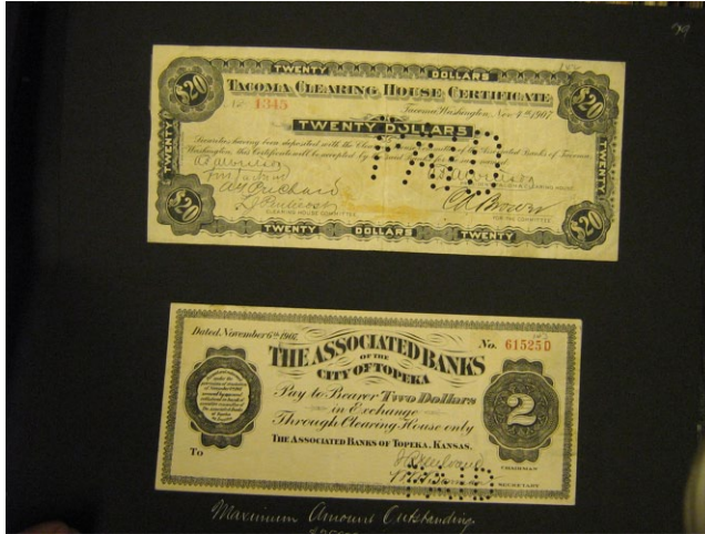
Figure 2. Sample of Small Denomination Currency Substitutes Issued during the Panic of 1907

involved all banks in a community. A single bank or a small number of banks would not issue currency substitutes, because this action might be construed as indicating unsound conditions. But once the currency substitute program was established in a given community, all the banks would have an incentive to participate, because they would otherwise run the risk of being drained of money, as depositors would prefer legal money. Figure 2 shows two examples of small denomination currency substitutes issued during the Panic of 1907.