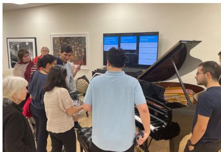
The group watches the Spirio, a self-playing grand