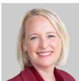
Julie Sweet '92 Chair and CEO, Accenture