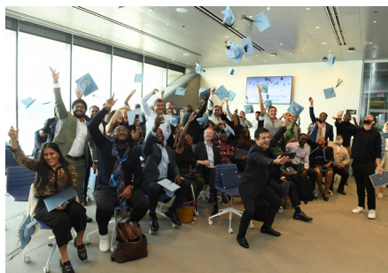
Graduation ceremony for the '23-24 EC-Africa cohort

In June 2024, the ECLA program held its first alumni reunion, welcoming back 30 entrepreneurs from 21 companies for a week of presentations, new classes, visits to companies in New York City, and several networking events. In November 2024, the ECLA program closed the recruitment period for its eighth cohort. Made up of 38 entrepreneurs from 16 companies and spanning multiple industries, including bulk materials handling, edTech, energy, fashion & apparel, food and beverage, finTech, health and supplements, media production, recycling, regulatory compliance, social impact, technology, and travel retail, this next ECLA cohort is set to begin its first module at the CBS campus in January 2025.