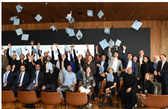
Graduation ceremony for the '23-24 cohort of the EC-America program

In January 2024, the Deming Center graduated the inaugural cohort of the pilot Entrepreneurship and Competitiveness for the United States (EC-America) program, offered for Hispanic-led businesses in the United States. Made up of 30 entrepreneurs from 12 companies based in Arizona, California, Washington DC, New York, North Carolina, Oklahoma, and Texas, the cohort spanned multiple industries, including advertising, agriculture, apparel, food and beverage, footwear, education, facilities management, packaging, and raw materials distribution. In the year-end evaluation results, 100% of participants stated that they were "extremely satisfied" with the '23-24 EC-America program overall, and 85% of participants reported that the project work had "great impact" within their companies. On their experience in EC-America, one participant said, "The program overall was an incredible opportunity to iterate on your company while having a network of peers and mentors to provide input and support along the way. It did a great job of creating a community to exchange business best practices and foster healthy entrepreneurial debate." Other participants expressed similar sentiments, saying, "This program has transformed our ideology of business for the better," and, "The program went above and beyond my expectations."