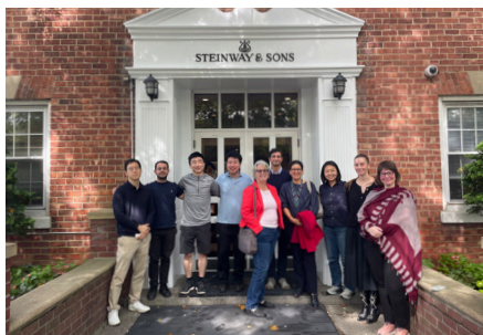
Group photo at the headquarter entrance