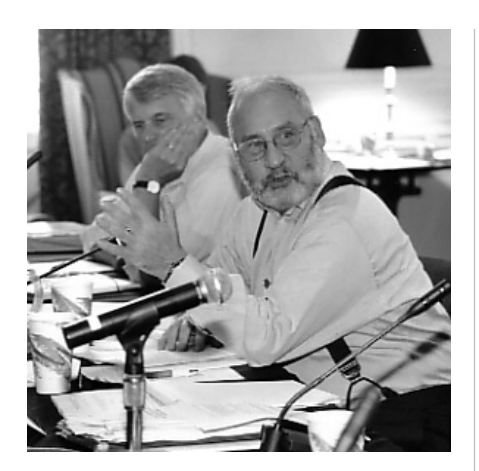
Peter M. A. L. Plompen and Joseph Stiglitz, left to right

Intellectual property is now seen as essentially similar to tangible property. However, the inberent "public goods" aspect of intellectual property makes it more prone to free riding and, consequently, rights bolders typically argue that stronger protection is necessary to achieve adequate returns and optimal levels of innovation.