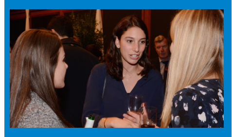
Alumni and friends exchange ideas at the 11th Annual Pershing Square Value Investing and Philanthropy Challenge