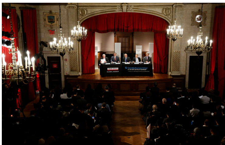
A CJEB event featuring Professor Joseph Stiglitz at Columbia University