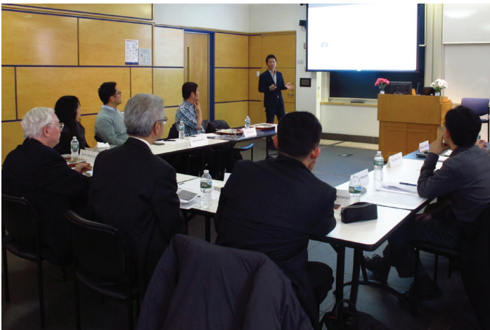
Visiting Scholar Seminar

Further information can be found on our website at https://business.columbia.edu/cjeb/about/visiting-scholars-program