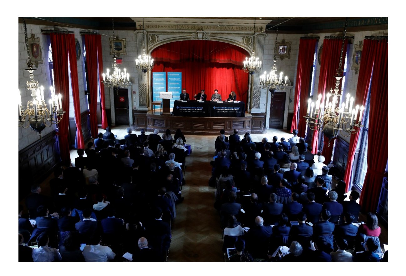
This conference was held on background according to the Chatham House Rule; the following summary is primarily without attribution

February 26, 2018 The Italian Academy, Columbia University