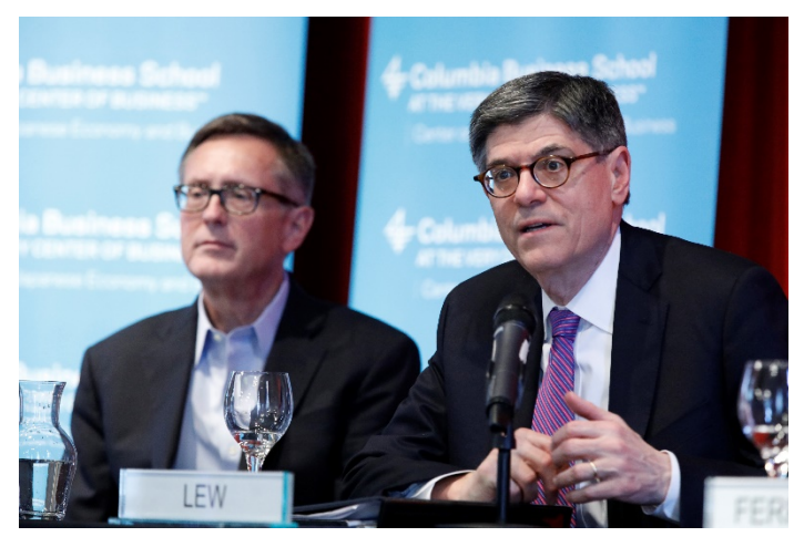
Left to right: Richard Clarida, Jacob Lew

that high frequency trading can exacerbate market volatility in the short-term. Regarding the long-term, another panelist cited global indebtedness, aging populations around the world, reactions against globalization and open trade, and rising inequality as pressures on economic and political systems that threaten to create long-term market volatility. In response to these projections, the panelist stated that possible strategies for long-term investors include increasing risk, seeking new revenue streams, and reducing expense ratios to increase returns. The panelist also remarked that investors may have to accept that returns will generally be