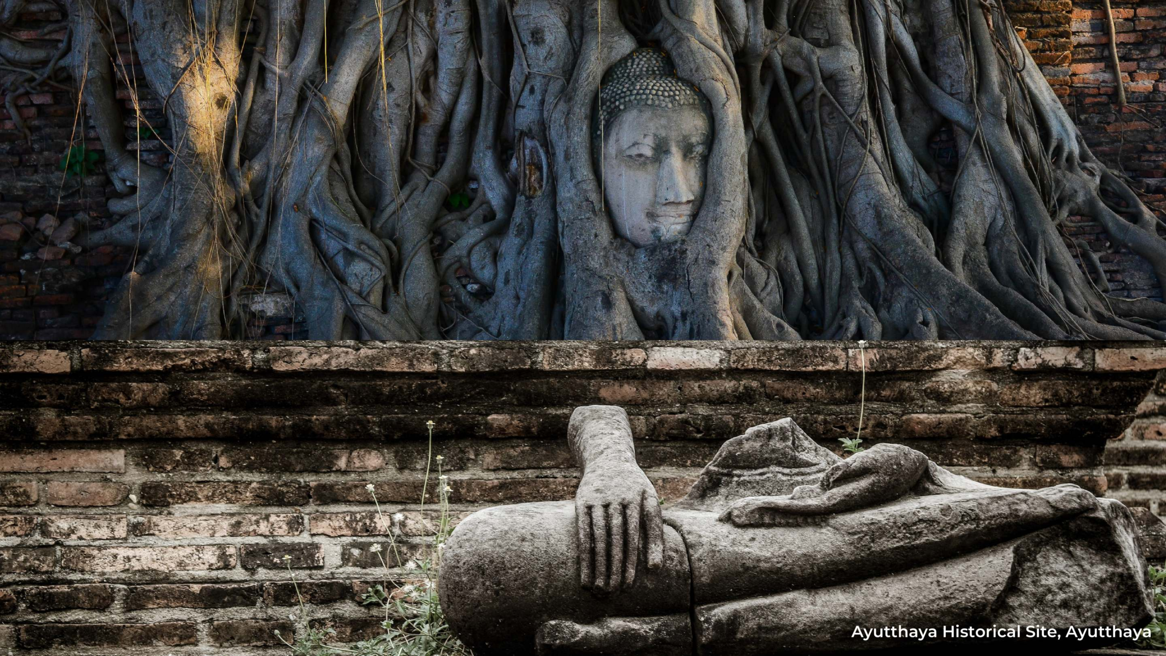
Ayutthaya Historical Site, Ayutthaya