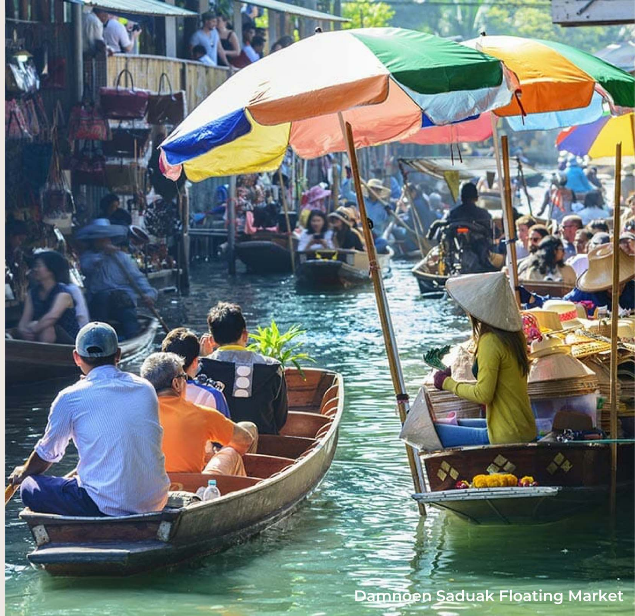
Damnoen Saduak Floating Market