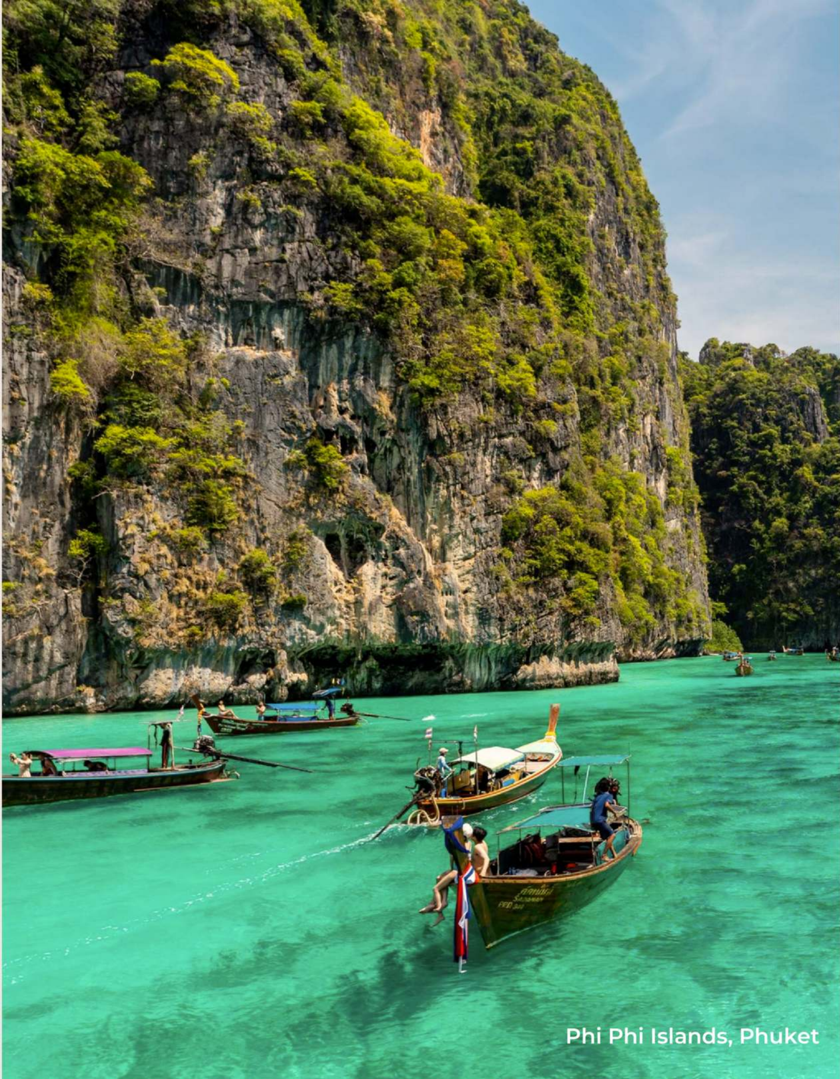
Phi Phi Islands, Phuket