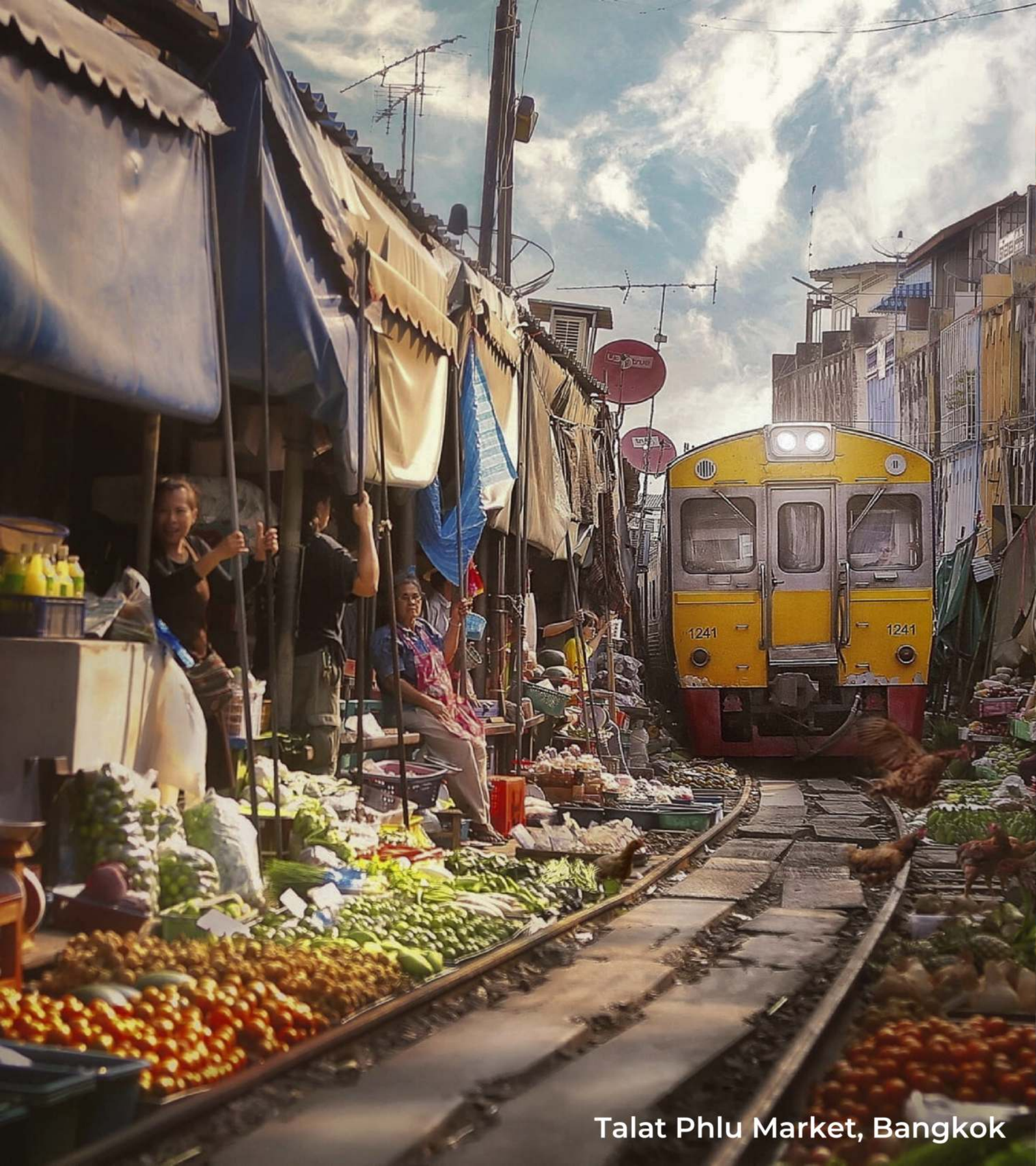
Talat Phlu Market, Bangkok