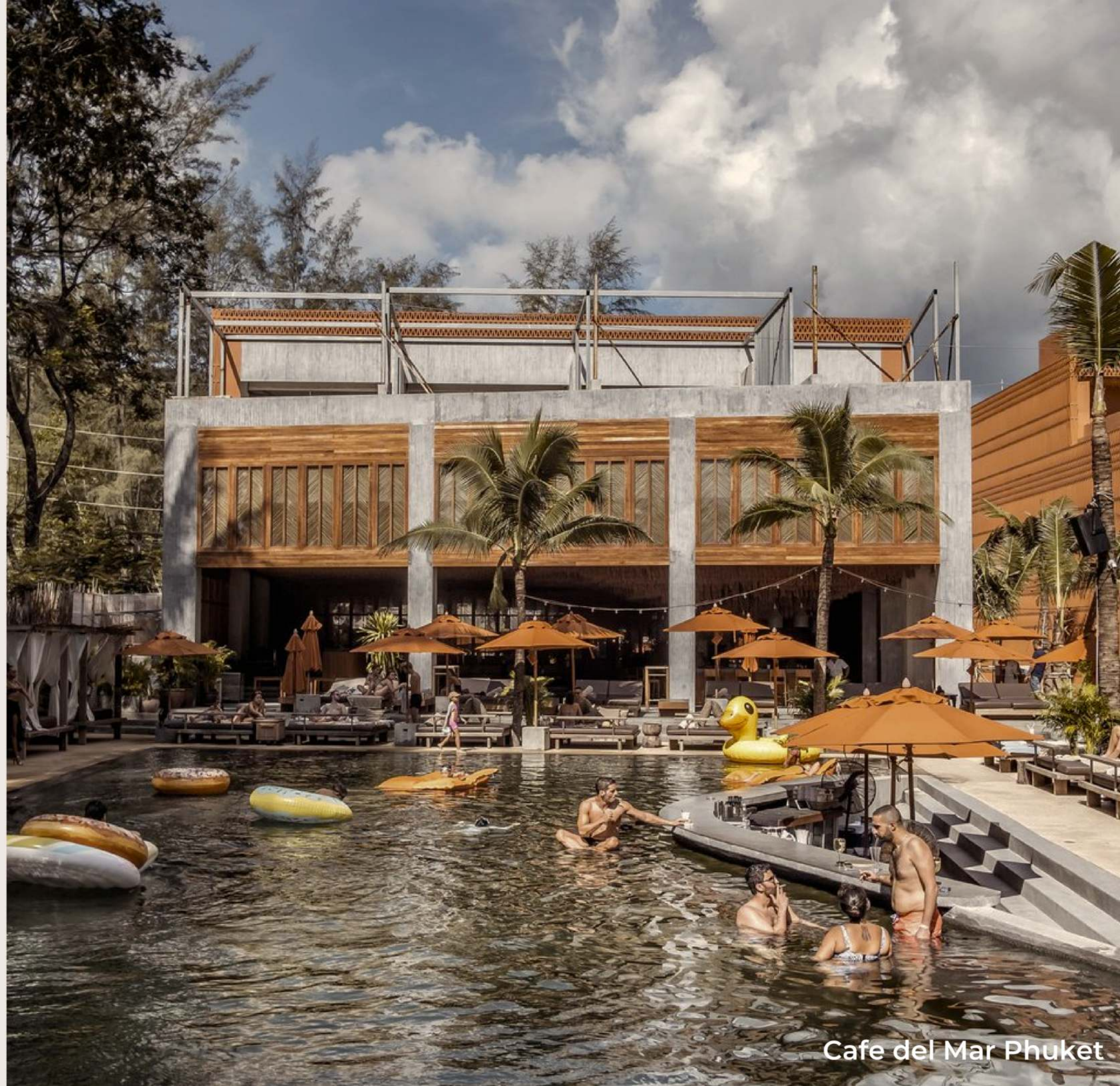
Cafe del Mar Phuket