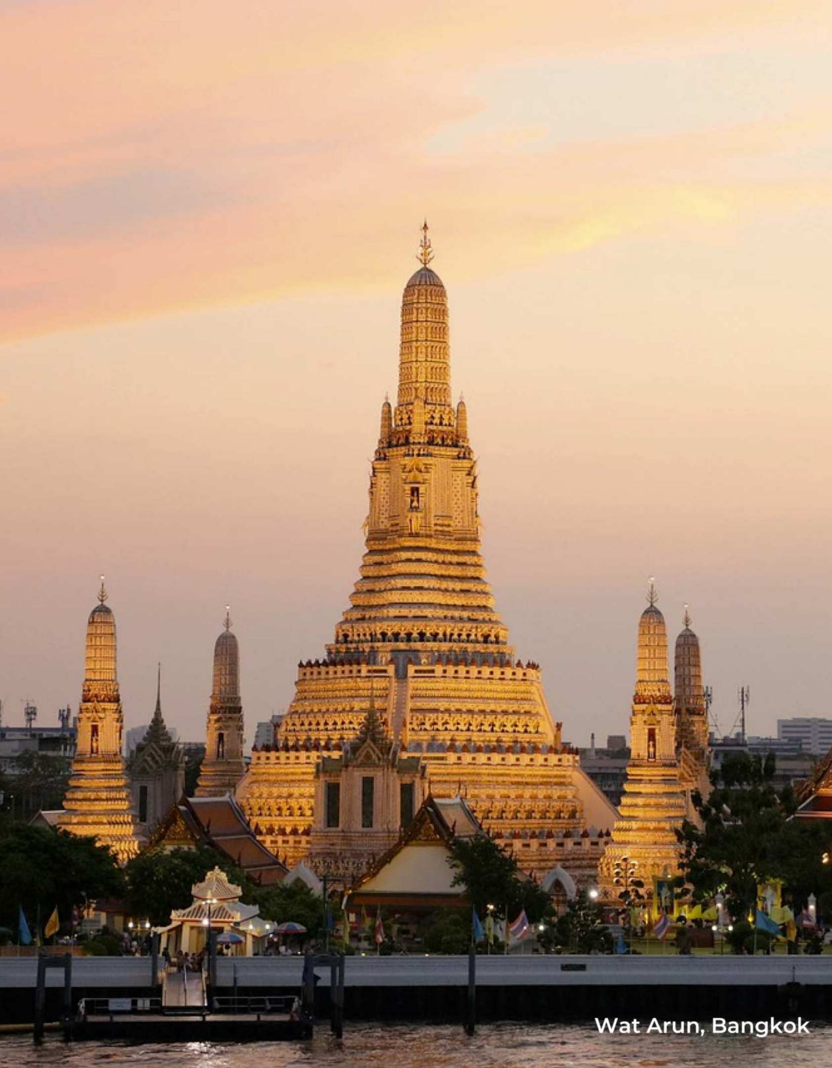
Wat Arun, Bangkok