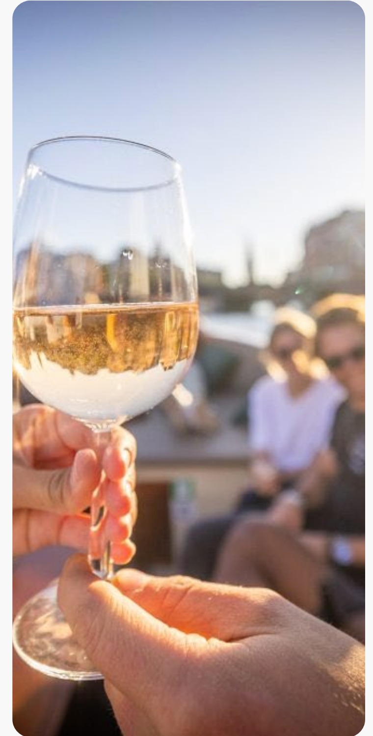
Amsterdam Canal Wine Cruise