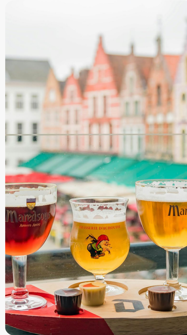
Belgian Beer Tasting