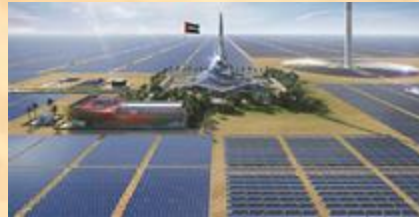
Dubai Electricity and Water Authority's Solar Park and Desalination Complex