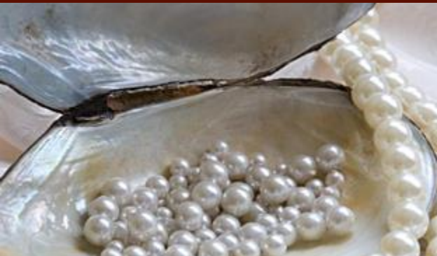
Pearling Path UNESCO Site