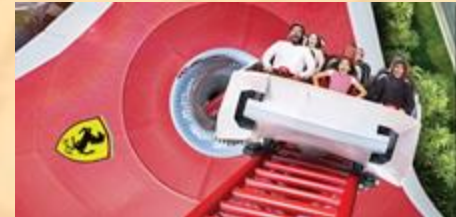
Miral Experiences , operators of Ferrari World