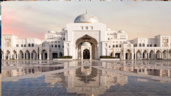
Sheikh Zayed Grand Mosque