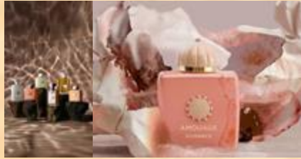
House of Amouage , international luxury fragrance house