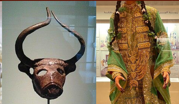
Bahrain National Museum