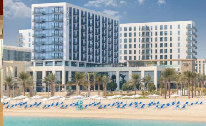
Vida Marassi Beach Resort