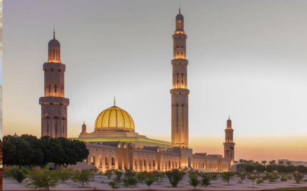
Sultan Qaboos Grand Mosque