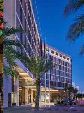
Mysk Al Mouj Hotel