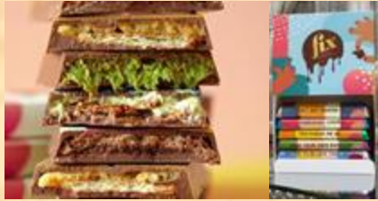
Fix Dessert Chocolatier , creators of original Dubai Chocolate