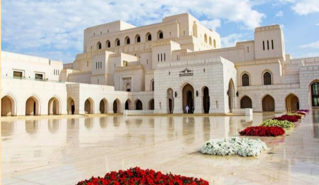
Royal Opera House