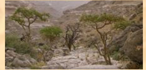
Frankincense Distillery , producers of renown traditional resin