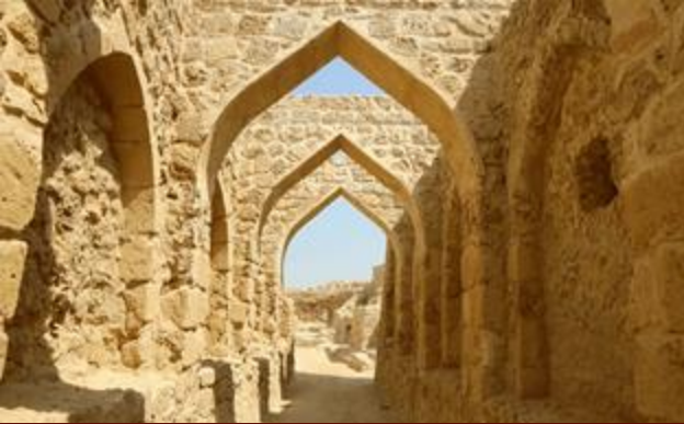
Bahrain Fort UNESCO Site