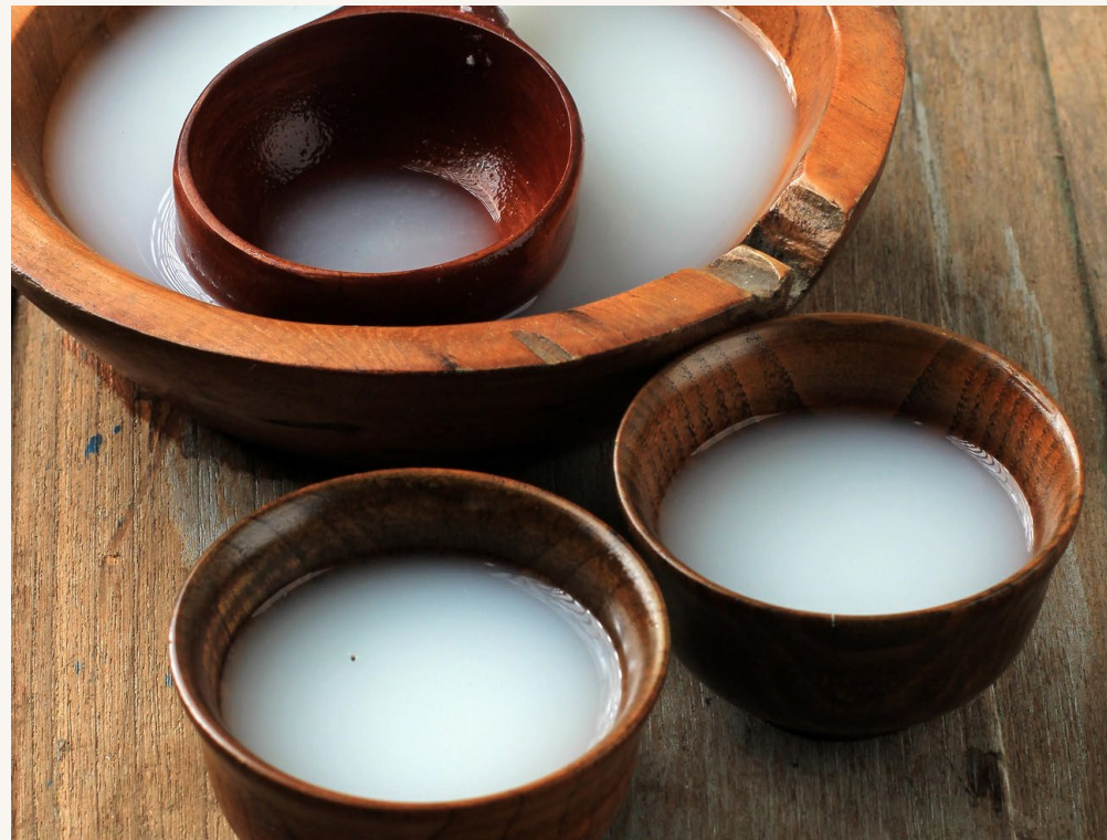
Traditional Rice Wine Tour