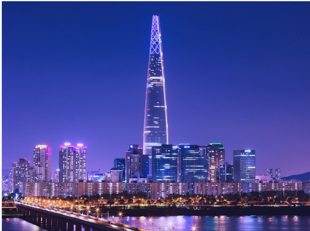
Seoul Jan 10 - 13