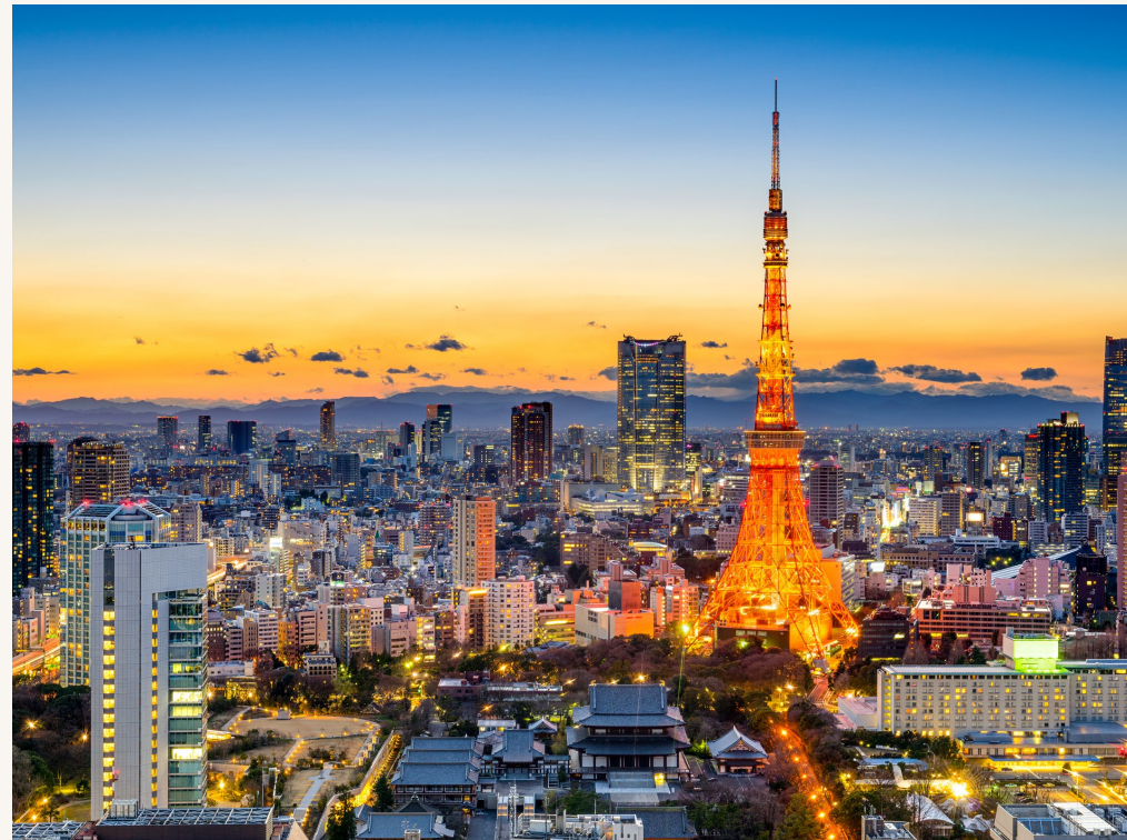
Tokyo Jan 13 - 16