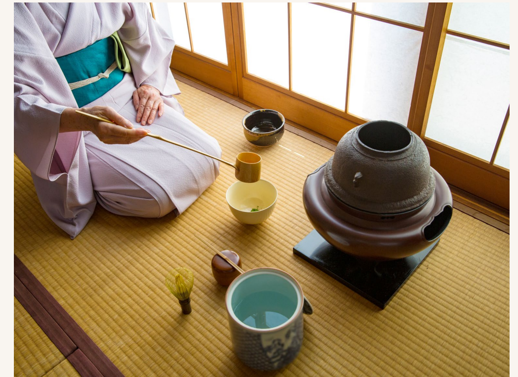
Traditional Tea Ceremony