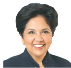
Indra Nooyi PEPSICO