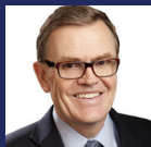
David Abney Chairman & CEO UPS