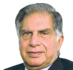
Ratan Tata TATA SONS