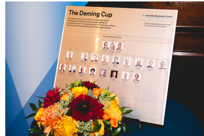
Deming Cup winners plaque