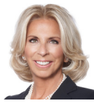
Janet DiFiore COURT OF APPEALS & THE STATE OF NEW YORK