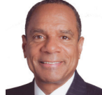
Kenneth Chenault AMERICAN EXPRESS