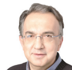
Sergio Marchionne FIAT CHRYSLER AUTOMOBILES