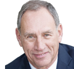
Toby Cosgrove CLEVELAND CLINIC