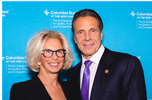
Chief Judge Janet DiFiore and Governor Andrew Cuomo