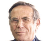
Stef Wertheimer ISCAR