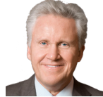
Jeffrey Immelt GE