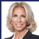
Janet DiFiore Chief Judge Court of Appeals & The State of New York