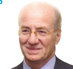
Paolo Rocca TENARIS