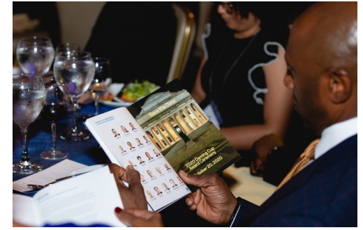
Guests at the UPS table