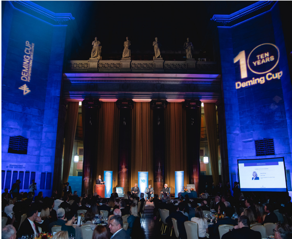
Governor Andrew Cuomo introducing Chief Judge Janet DiFiore to the gathering.