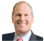
David Cote HONEYWELL