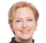
Ellen Kullman DUPONT