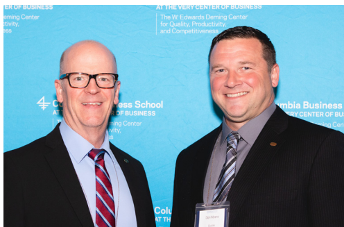
Guests from Ecolab