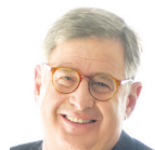
Samuel Palmisano IBM