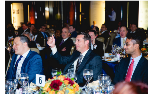
Guests from Best Buy