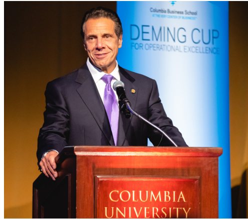
Governor Andrew Cuomo

As he set up DiFiore’s introduction as the first public-sector awardee of the Deming Cup, Cuomo delivered a powerful case for the imperative of sound management principles in the functioning of government or any office devoted to public service.