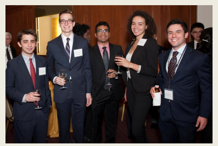
Engineering students who attended the ceremony