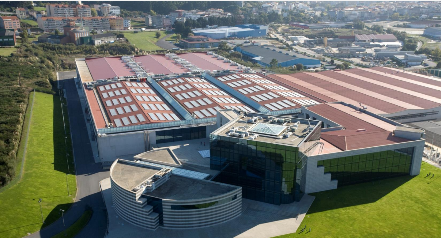
Inditex's headquarters in Arteixo, La Coruña, Spain