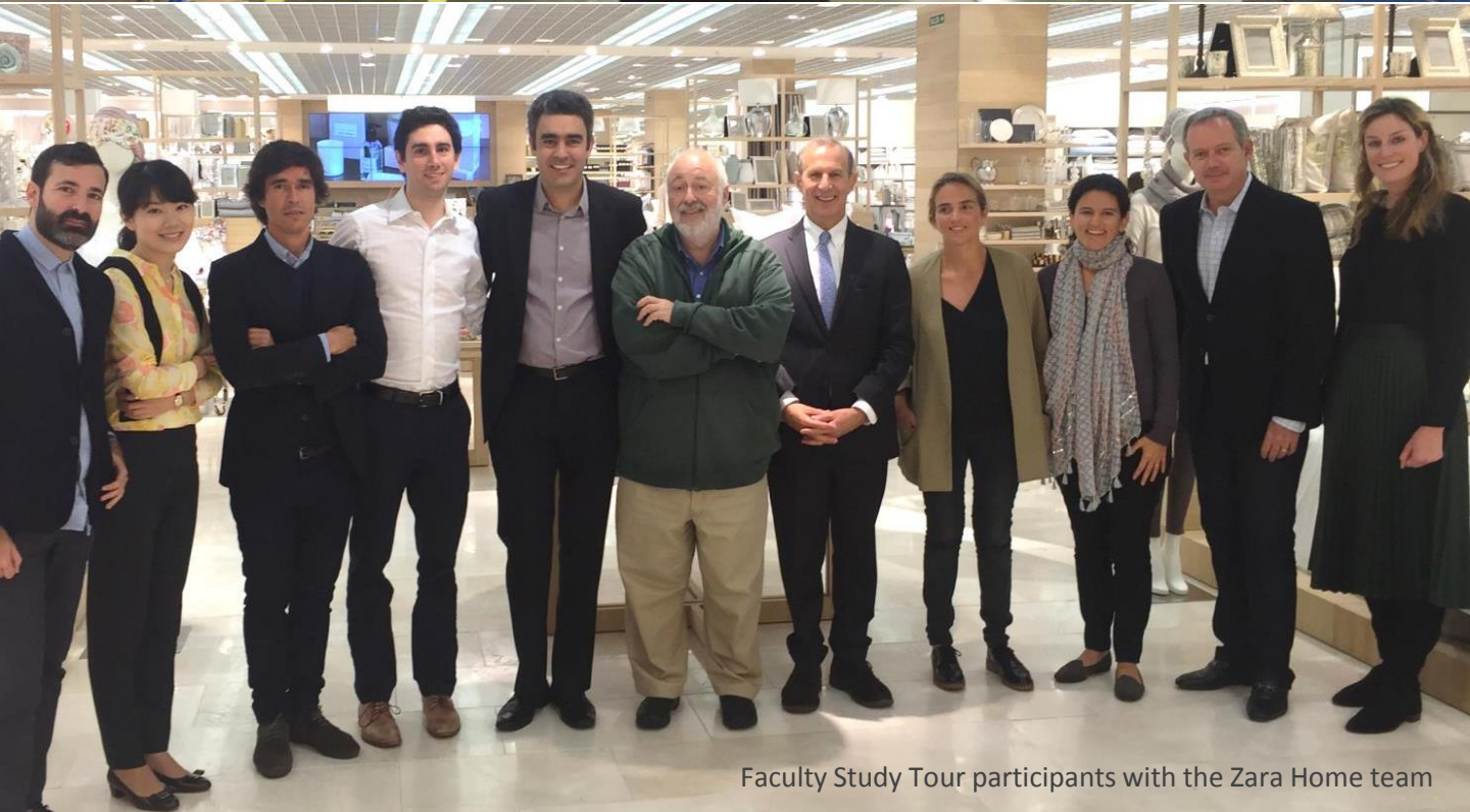
Faculty Study Tour participants with the Zara Home team