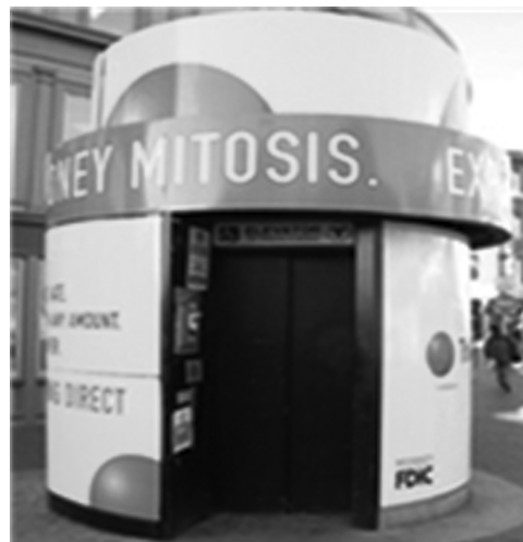
Figure 1 An outdoor ad for ING Direct

An outdoor ad for ING Direct touts 'Money Mitosis'. Mitosis refers to the process in which a cell duplicates its chromosomes to generate two identical cells. The word offers ING Direct a unique way to communicate that at ING Direct: You can expect your money to grow.