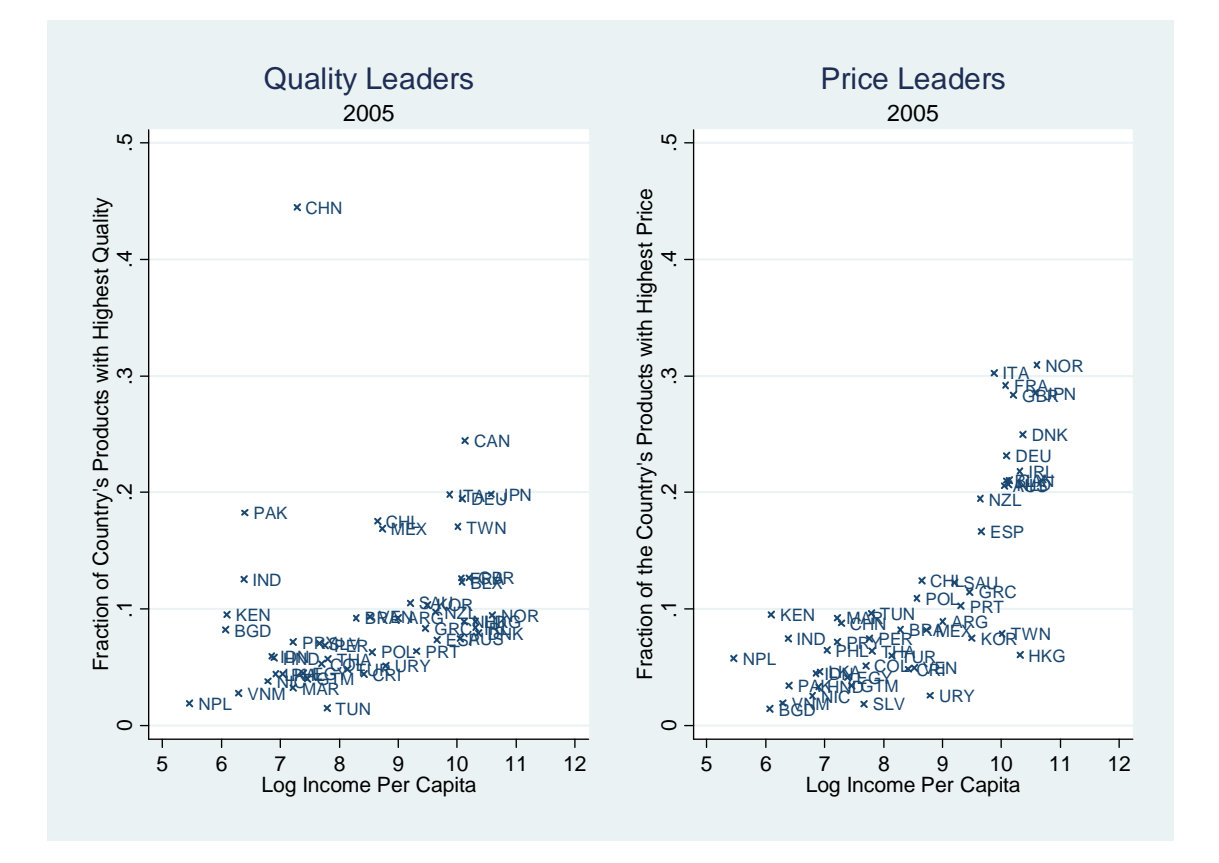
Figure 1: Quality and Price Leaders