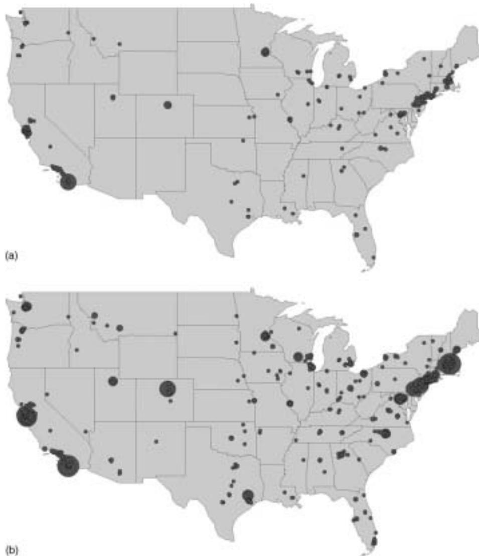
Fig. 1. Distribution of biotechnology companies in (a) 1983 and (b) 1995.

between biotech firm i and the lead inventor on patent j .